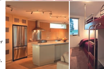
THE LIGHT HOUSE