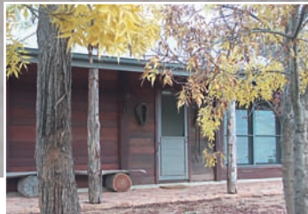
THE CATTLEMAN'S HUT

This magnificent facility has been purpose built with great attention to detail to cater specifically for the Natural Horseman.